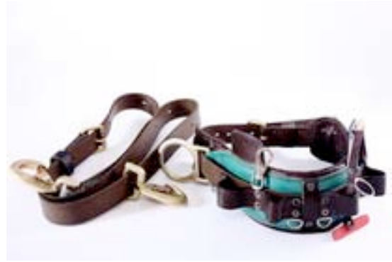
Safety Belt & Pole Strap