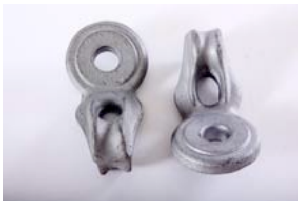
Angle Forged Eye Nut