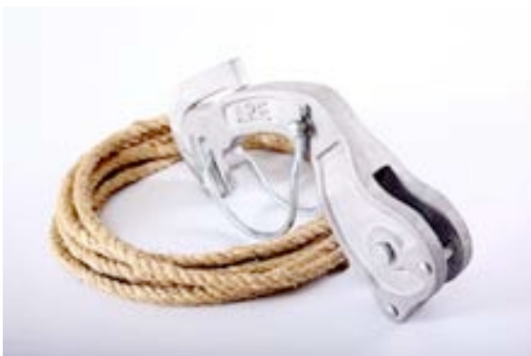
Aerial Handlise (รอกเชือกส่งของ)