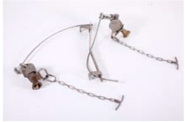
Cable Ladder (เป็นชนิดกำแพง)