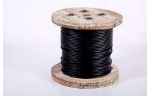
Galvanized Steel Ground Wire (TOT)