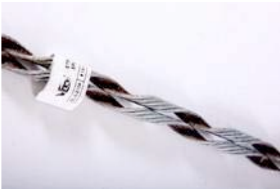
Preform Strand Splice