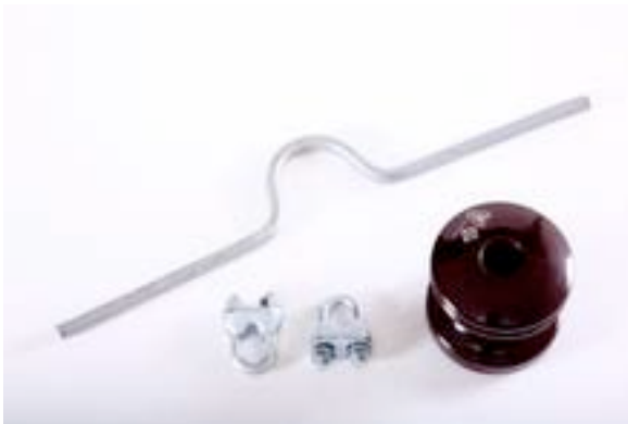
Cable Suspension Omega Type