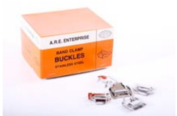
Stainless Steel Buckle