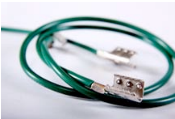
Ground Wire Clip