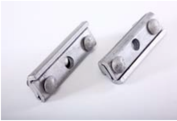
Cable Suspension Clamp Straight