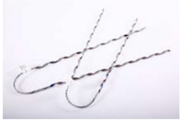
Preform Guy Grip Deadend