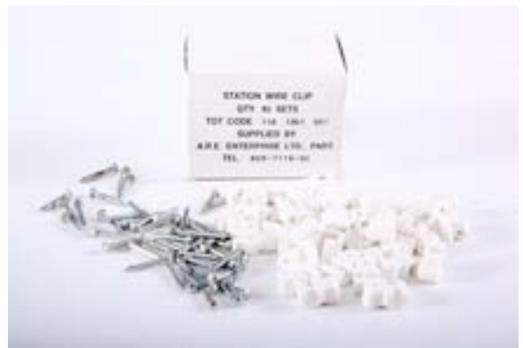
Station Wire Clip