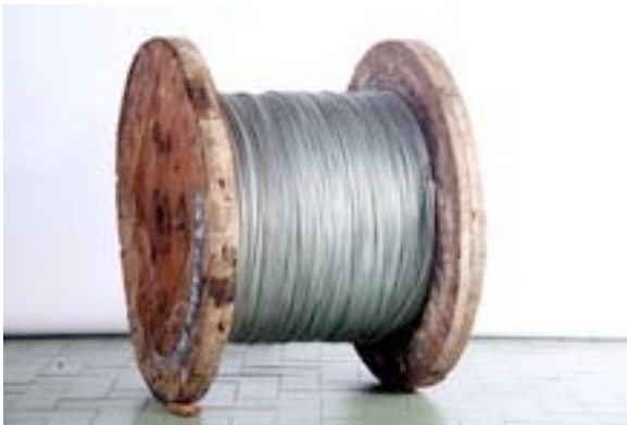
Galvanized Steel Strand