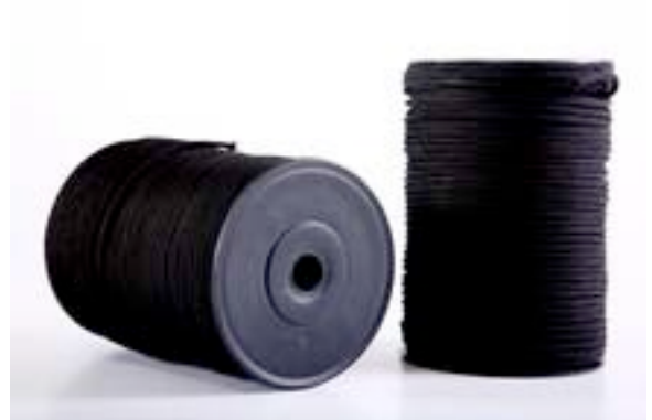
Cable Binding Rope