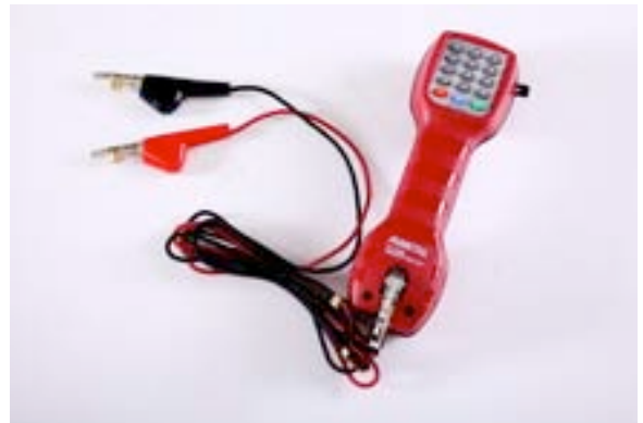
Lineman Test Set