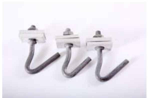
Span Clamp Type C