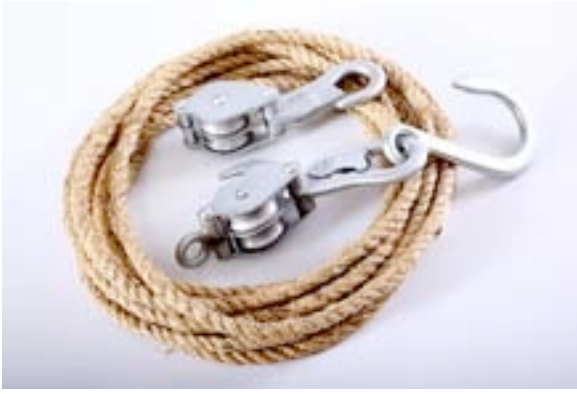
Self Locking Block Tackle (รอกเชือกตึงเดมัล)