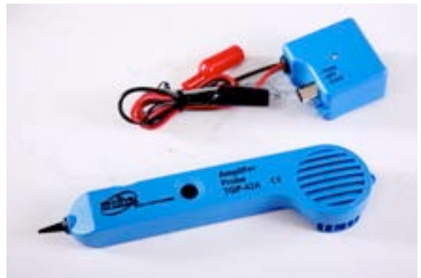
Tone Generator And Probe