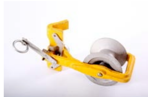
Cable Block Type D