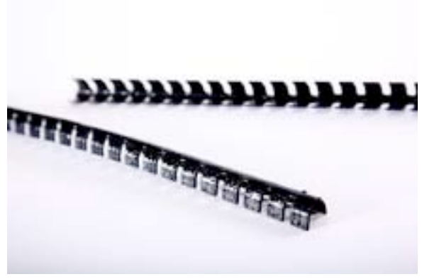
Drop Wire Clip