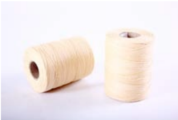
Lacing Twine 6 Piles