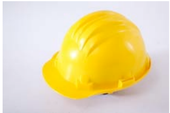
Safety Helmet Model