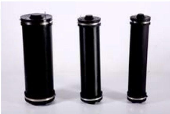
PVC Terminating Sleeve (ท่อดำ)