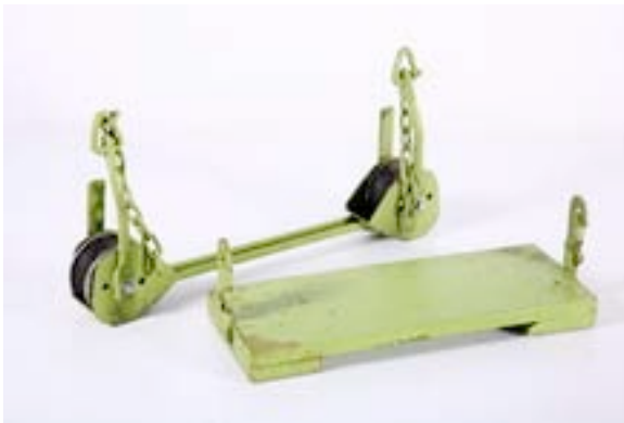
Cable Car (ชิงช้าเลื่อน)