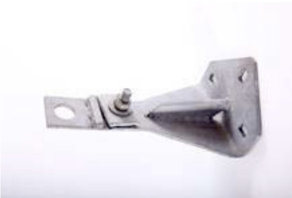
Cable Extension Meter Arm