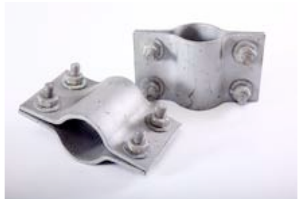
Cable Stopper Clamp