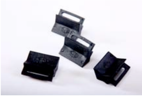
Plastic Cable Spacer