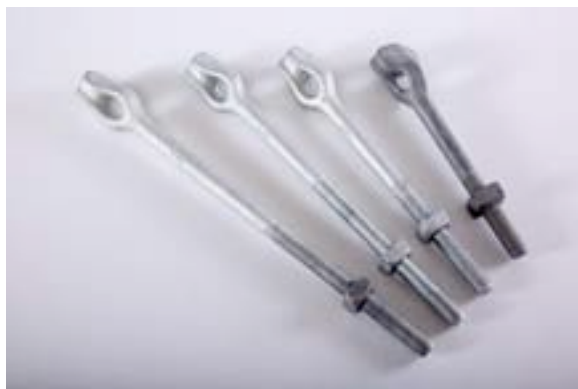
Straight Timbleye Bolt