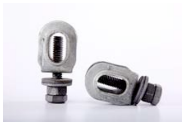
King Ground Clamp