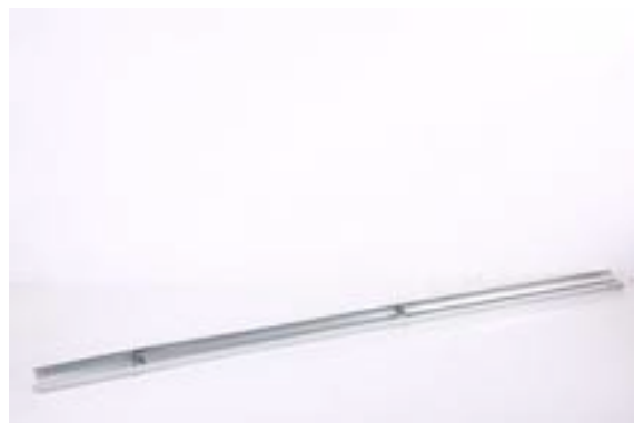
Guy Wire Protector