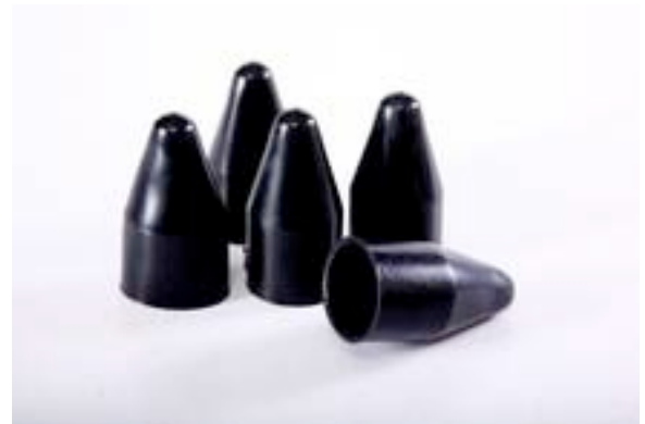
PVC For Subduct