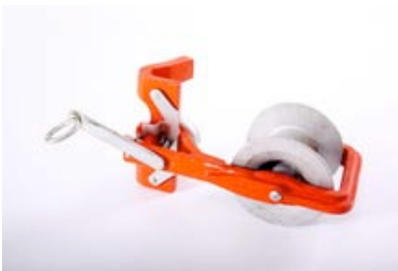
Cable Block Type D