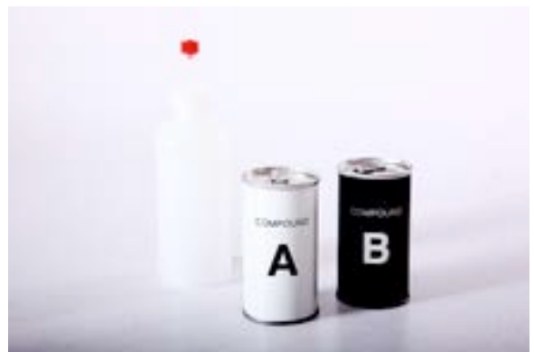
Duct Sealing Compound Pig 470