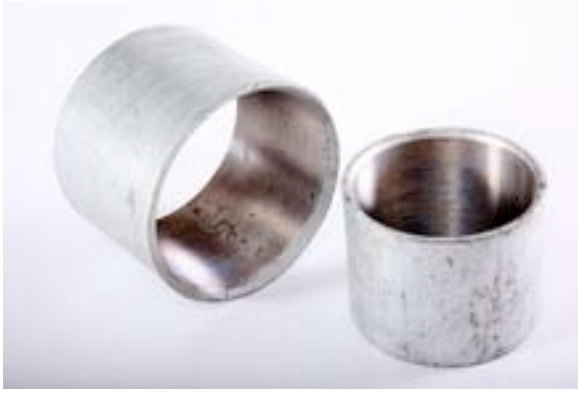
Gip Coupling (ข้อต่อ)