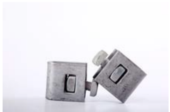
Strand Ground Clamp