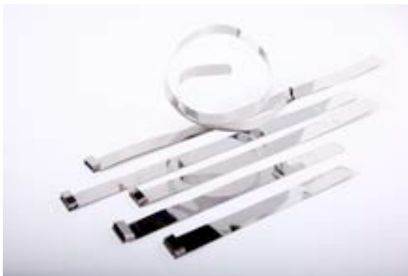
Cable Support for Lashed Cable