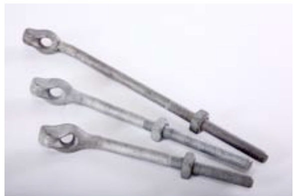
Angle Thimble Eye Bolt