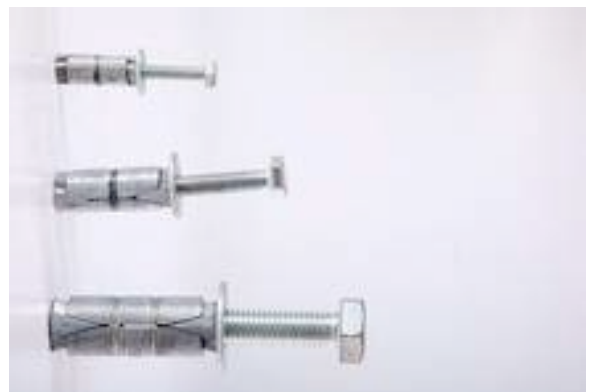
Expansion Shield With Bolt