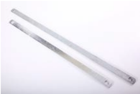
Steel Flat Cross Arm Braces