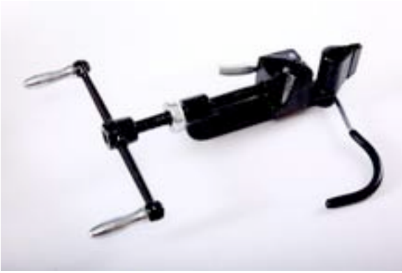
Band it Tool