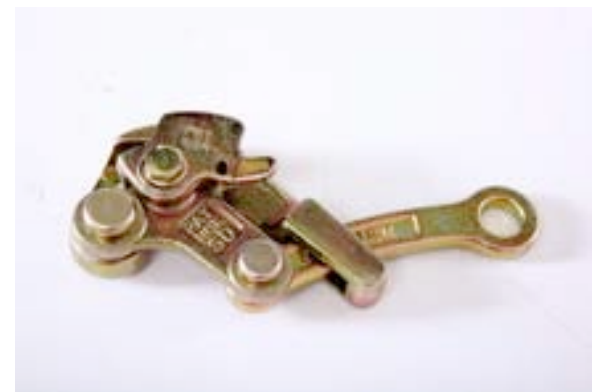
Cable Grip (เล็บผี)