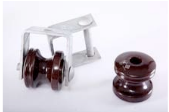
Cable Suspension Clamp U-Type