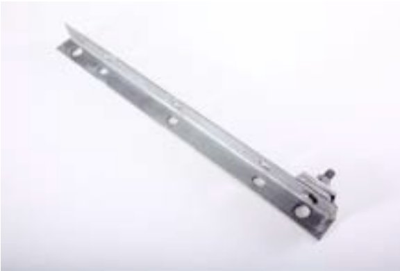
Cable Extension Metal Arm