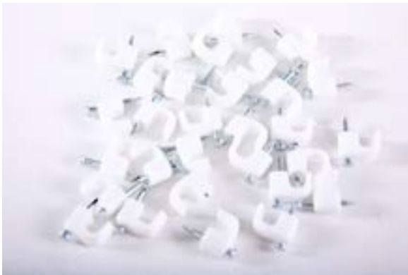
Station Wire Clip