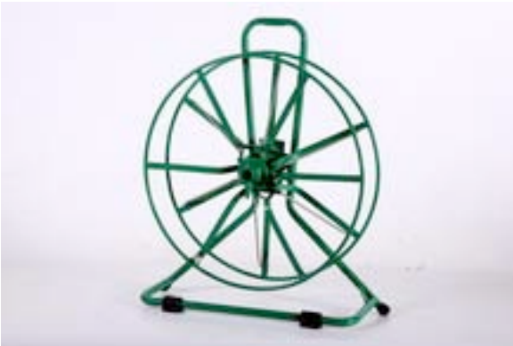
Drop Wire Reel