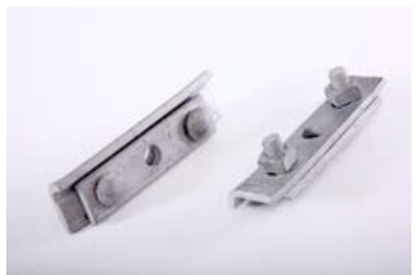
Cable Curve Suspension Clamp