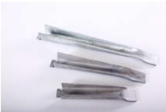
Cable Rack Hook