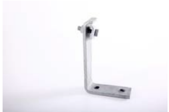
Cable Extension Metal Arm