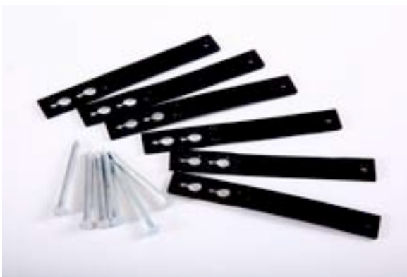
Plastic Drive Ring