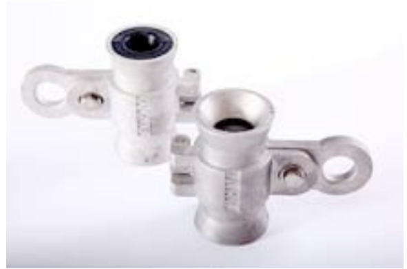
Optical Fiber Cable Clamp