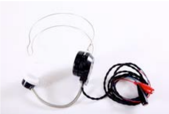
Head Set R1