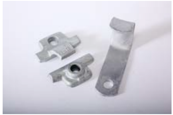
Cable Suspension Clamp Fig 8