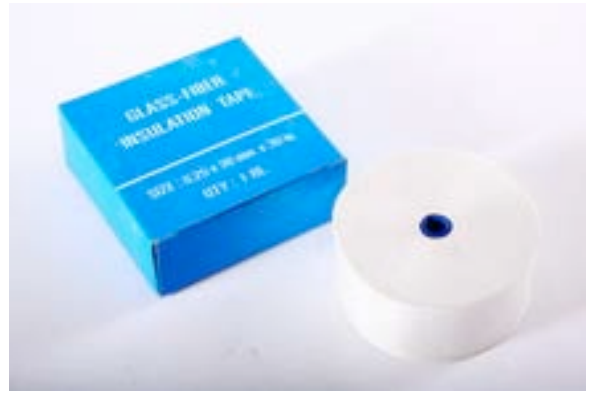
Glass Fiber Tape