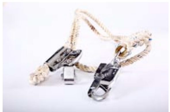
Safety Belt HC-27