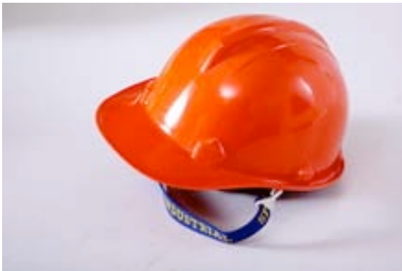
Safety Helmet Model