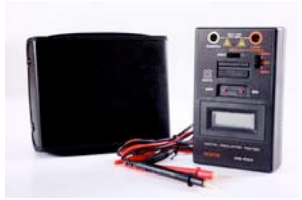
Digital Insulation Tester