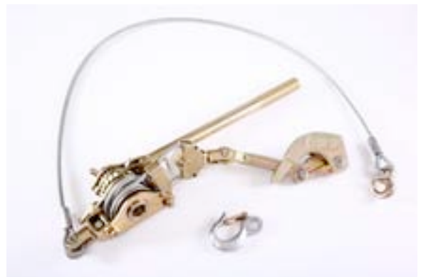
Ratchet Puller Set (รอกดึงสาย 1.5 ตัน)