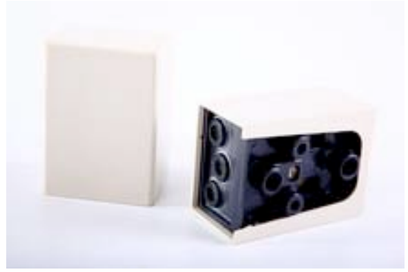
Telephone Station Protector (กันฟ้า)