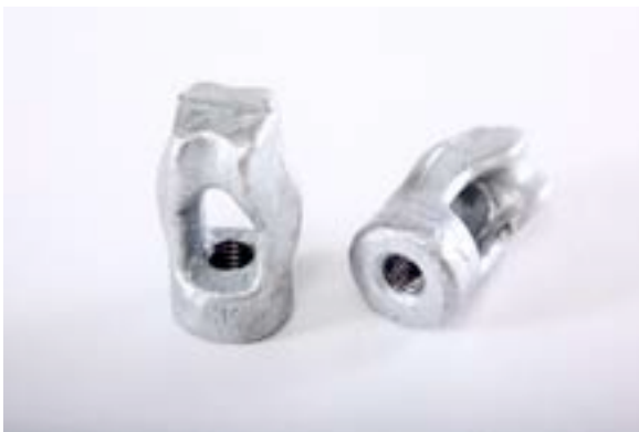
Forged Eye Nut