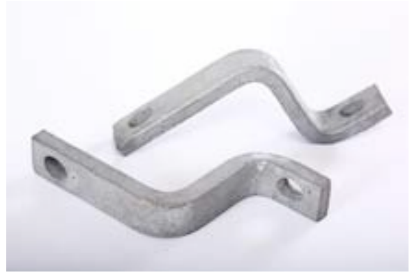
Cable Rack Extension