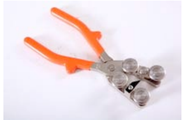
กรรไกร 4 ล้อกรีดเดมิล