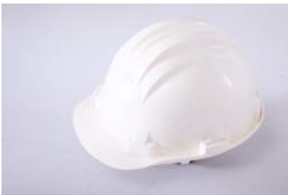
Safety Helmet Model