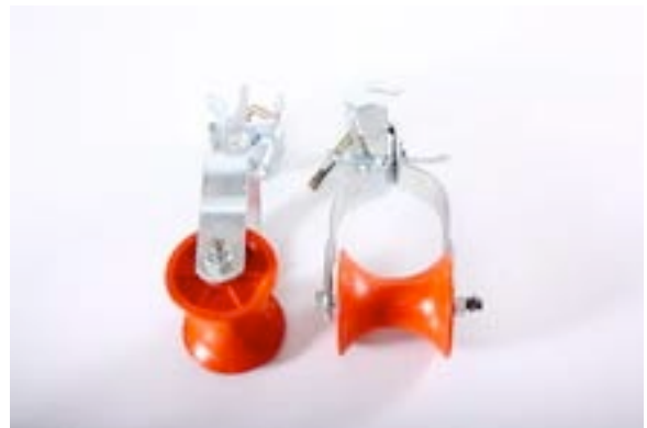
Cable Block Small (รอกส้ม)