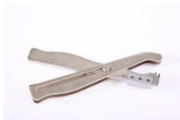
Lap Cutter #1