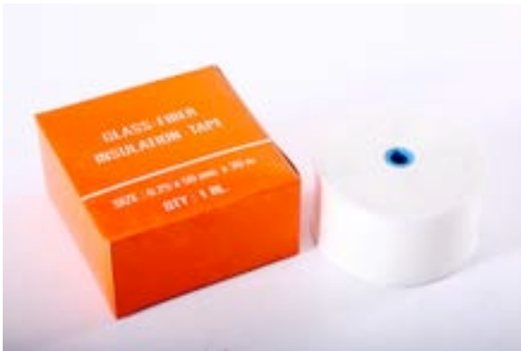
Glass Fiber Tape