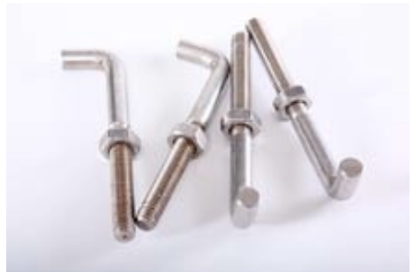
Stainless Steel Bolt & Nut