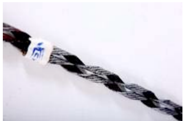
Preform Strand Splice