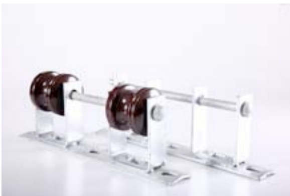
Rack 5 MM 2 Spool (เหล็ก)