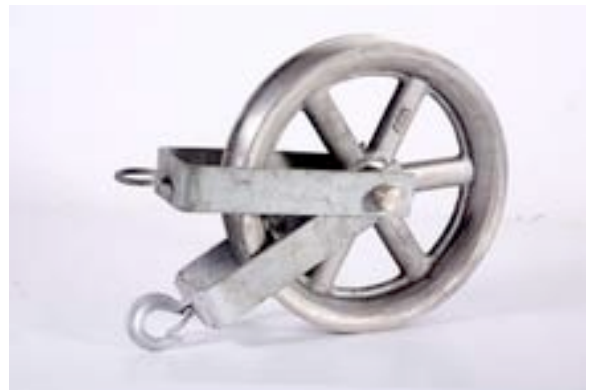
Manhole Sheave (รถยกปากบ่อพัก)