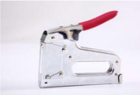
Staple Gun Tacker Arrow Model T-18