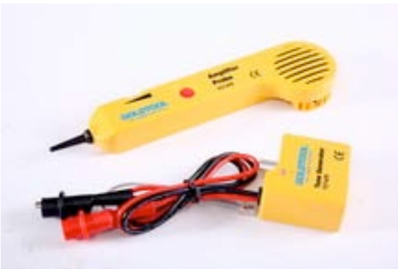
Tone Generator And Probe