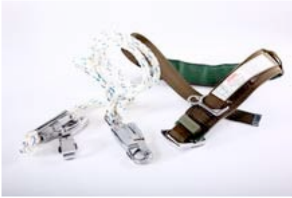
Safety Belt HC-113