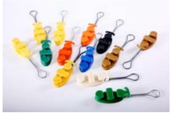
Drop Wire Clamp