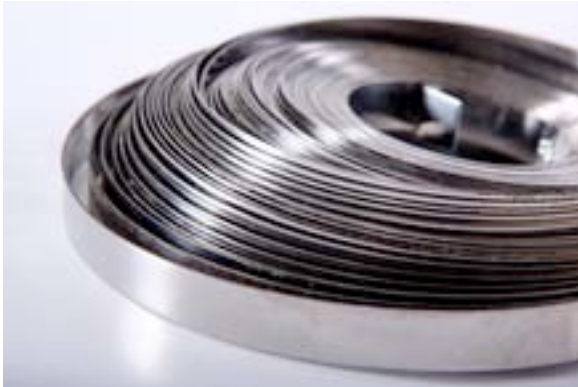
Stainless Steel Band