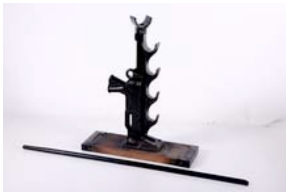
Ratchet Jack (แม่แรงยกเคเบิล 10 ตัน)