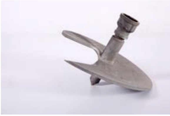
Swamp Screw Anchor