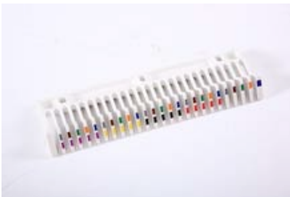
Wire Guide Kit