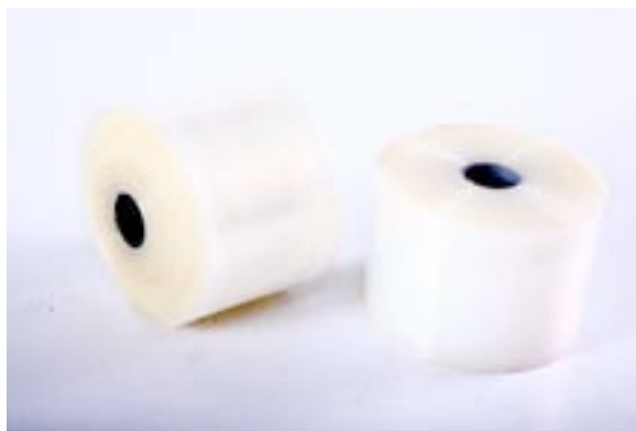
PVC Non Adhesive Transparent Tape