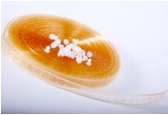
PVC Wire Banding Band